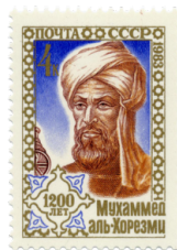
Muhammad ibn Musa al-Khwarizmi ~ 780 - ~ 850 (≈ Algorithms)