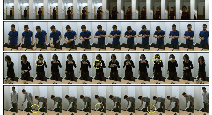
Figure 4: Sample frames of correctly (a), (b) and incorrectly (c), (d) classified test sequences. In (c), the person hesitates and adjusts her cup before completing a drink , making the sequence more similar to an incomplete drink . In (d), using JV solely, the hand seems to perform a pull in full even when the drawer remains unmoved. Again the motion is similar to a complete pull .

(d) label: incomplete pull predicted: complete pull